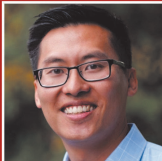
Assemblyman Vince Fong