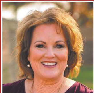
Senator Shannon Grove